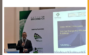
Emrill Participation (MEFMA Seminar) at World Future Energy Summit January 15, 2018

Thank you for your active membership and continuous show of support for MEFMA programs and initiatives