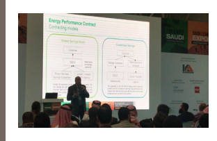
Enova's Participation at MEFMA Masterclass (FM EXPO SAUDI) January 29, 2019

Thank you for your active membership & continuous show of support for MEFMA programs and initiatives