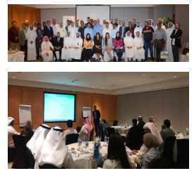
MEFMA October 2018 Events in Kuwait Sponsored by UFM

Thank you for your active membership and continuous show of support for MEFMA programs and initiatives